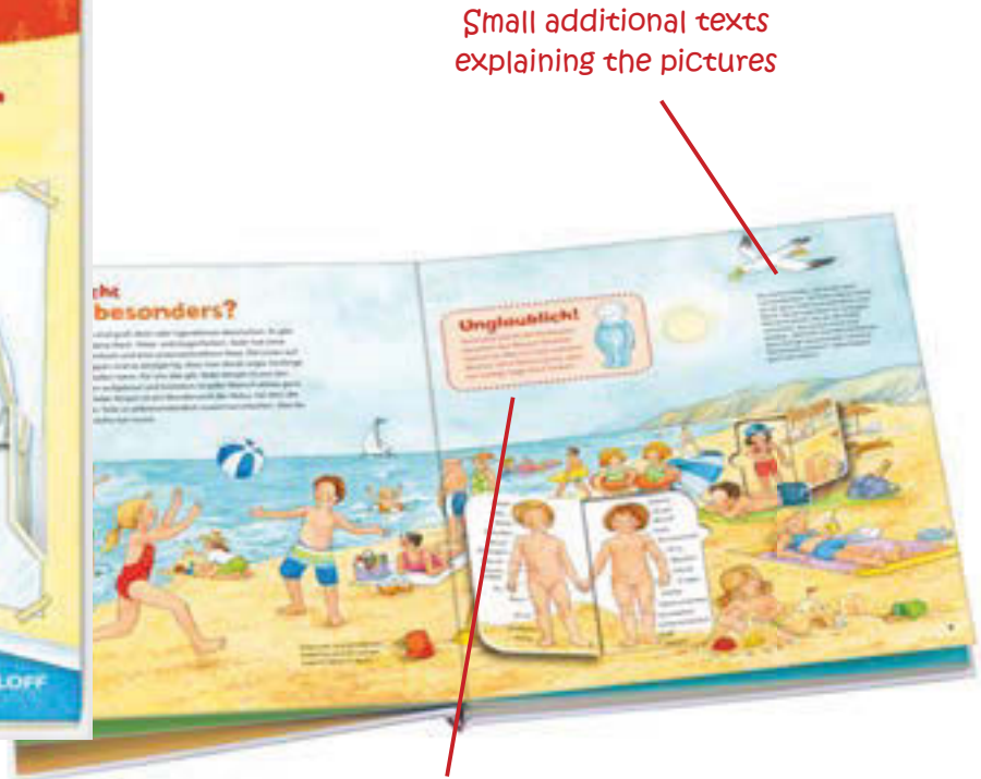
One action box on each double page