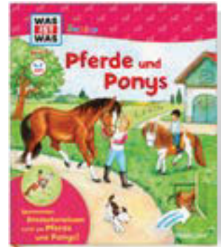
Horses and Ponies