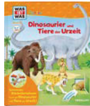
Dinosaurs and Prehistoric Mammals