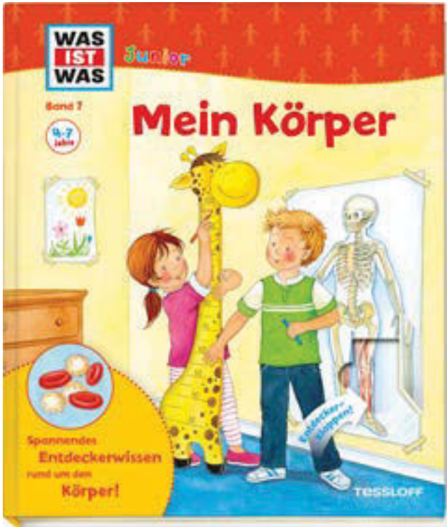
WAS IST WAS Junior. My Body