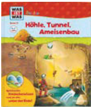
Caves, Tunnels, Anthill