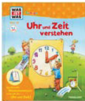
Understanding Clocks and Time