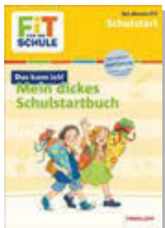
1st Grade. My Big Book for Starting School (128 pp)