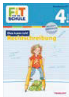
4th Grade. Spelling