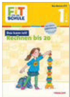
1st Grade. Calculating to 20