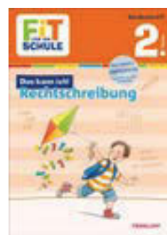
2nd Grade. Spelling