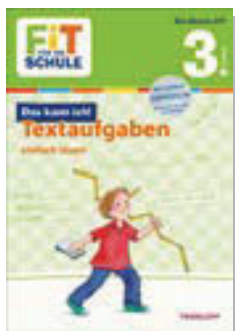
3rd Grade. Solving Math Problems the Easy Way