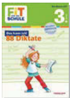
3rd Grade. 88 Dictations