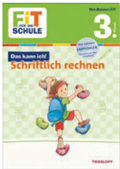
3rd Grade. Written Calculating