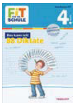
4th Grade. 88 Dictations