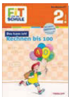
2nd Grade. Calculating to 100