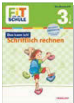
3rd Grade. Written Calculating