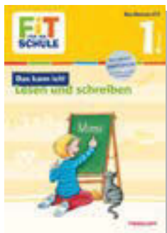
1st Grade. Reading and Writing