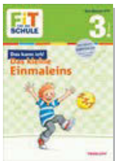
3rd Grade. Mini Multiplication Tables