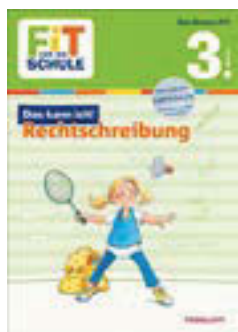
3rd Grade. Spelling