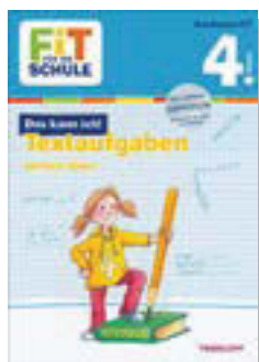
4th Grade. Solving Math Problems the Easy Way