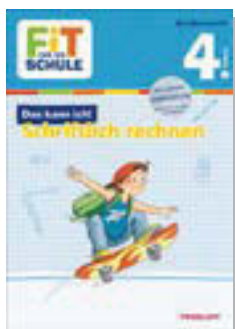
4th Grade. Written Calculating