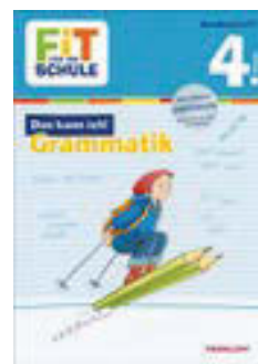
4th Grade. Grammar