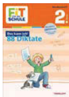
2nd Grade. 88 Dictations