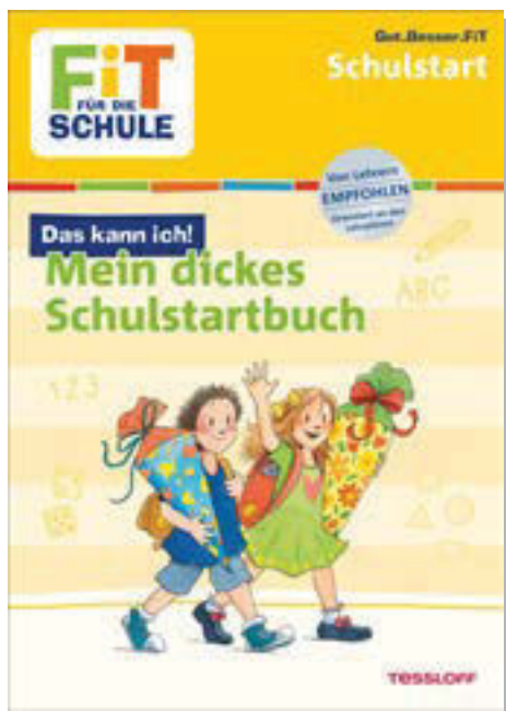
My Big Book for Starting School