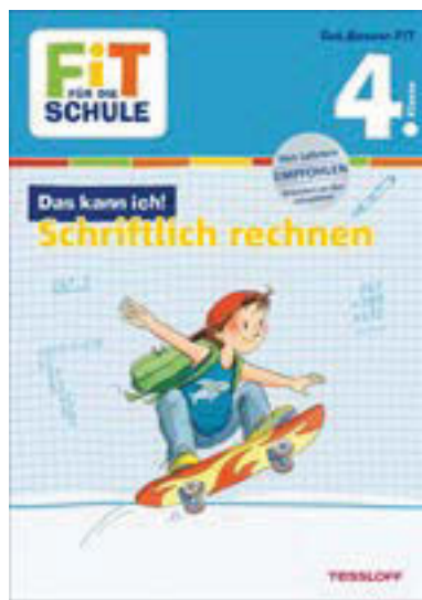
4th Grade. Written Calculating