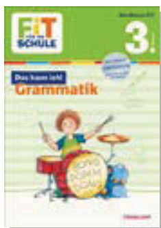
3rd Grade. Grammar