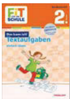
2nd Grade. Solving Math Problems the Easy Way